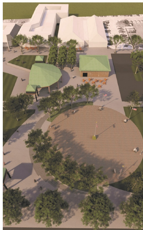
CONCEPT A: REFRESH

Concept B Revised overview: Replaces most amenities and surfaces with new elements and slightly changes the function of the space to adapt to how it is commonly used today. Cost: $7(+/-) Million.