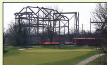
Photos taken in March. Left-most photo shows the cement floor being poured (looking northwest) & right-most photo is a view from hole #18 fairway (looking southwest).