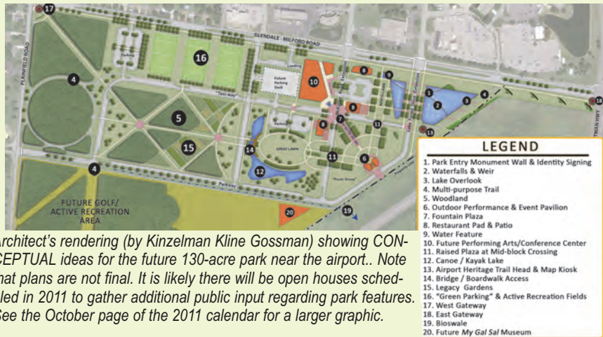
Architect’s rendering (by Kinzelman Kline Gossman) showing CONCEPTUAL ideas for the future 130-acre park near the airport.. Note that plans are not final. It is likely there will be open houses scheduled in 2011 to gather additional public input regarding park features. See the October page of the 2011 calendar for a larger graphic.

The City looks forward to development of this wonderful future 130-acre park and believes it will be a source of pride for Blue Ash residents for generations to come.