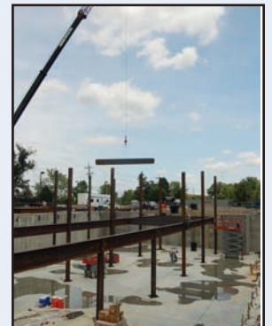
More construction photos of the Recreation Center project taken in June & July.