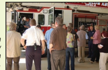
Highlights of the tour group from Ilmenau that visited Blue Ash in early May 2008. The group also placed a wreath at the Veterans Memorial.