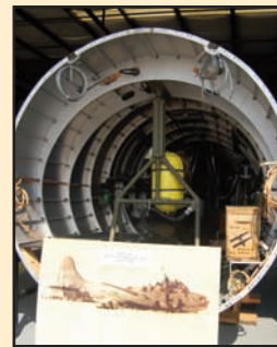
The "My Gal Sal" B-17 restoration project will be on display at the Airport Days event.

(Airport Days is presented with the support of the City of Blue Ash, but please note that this is not a City event.)