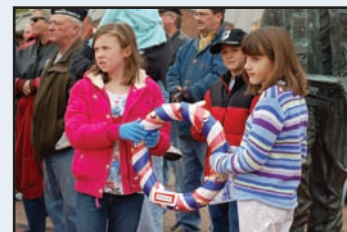
Pictured above from the 2007 ceremonies are Greene School students & (left) the Color Guard from American Legion Post 630.