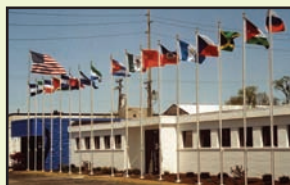
The Blue Ash based M25M facility on Kenwood flies the flags of the nations where assistance has been sent.

More M25M news ... in April, a team from M25M traveled to Nicaragua to review progress of existing programs and to explore opportunities for new ventures.