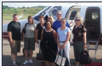
The Osterman Cron team ready to board the Kimball jet heading for New Orleans.

When the employees of Osterman Cron , a Blue Ash based office furniture business on Millington Ct., heard they were going to be recognized for being a top seller of Kimball's furniture, they were absolutely thrilled . And why not, since the grand prize was use of Kimball's corporate jet for