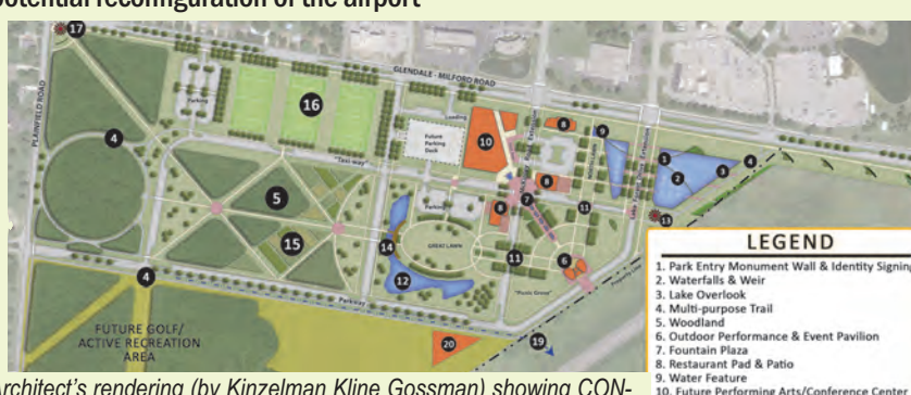
Architect's rendering (by Kinzelman Kline Gossman) showing CON-CEPTUAL ideas for the future 130-acre park near the airport. Note that plans are not final. It is likely there will be open houses scheduled in 2011 to gather additional public input regarding park features. See the October page of the 2011 calendar for a larger graphic.

The City looks forward to development of this wonderful future 130-acre park and believes it will be a source of pride for Blue Ash residents for generations to come.