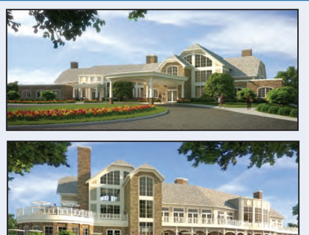
Architect's renderings of the new multi-functional golf clubhouse/banquet facility. Pictured top is the view from the front (Cooper Road), & pictured below is a view from the rear (golf course). Renderings by Steed Hammond Paul. See more information & renderings on the January page of the 2011 Community Calendar.

(Golf/Banquet facility article continued on Page 2.)