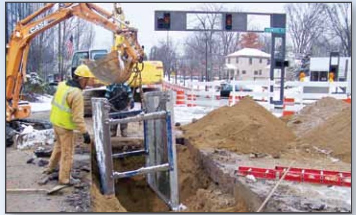
Construction crews insert a trench box in the intersection of Kenwood and Cooper Roads in order to install a new 36" waterline eventually leading into The City of Montgomery. The trench was close to 20' deep in some areas of the intersection in order to get under and around other utilities proving to be a very challenging and dangerous project.

Blue Ash has an ongoing program to upgrade traffic signals from incandescent lights to LED lights. The new LED lights use significantly less electricity, have a longer useful life, produce brighter signals, and include battery back-up systems. Also, "count-down" pedestrian signals are being installed at intersections with wide roadways. Six new traffic signals have been installed downtown and two new systems were installed on Reed Hartman Highway. The downtown signals are coordinated to provide improved traffic flow during heavy travel times.