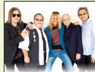
The Guess Who takes the Towne Square stage Sat., Aug. 28. Did you know that the Guess Who are considered superstars in their native country, Canada?

A Family Fun Area will feature affordable activities to keep everyone in your family entertained, including festival rides, inflatable toys, carnival games, family-friendly stage entertainment, clowns, and a magician, just to name a few.