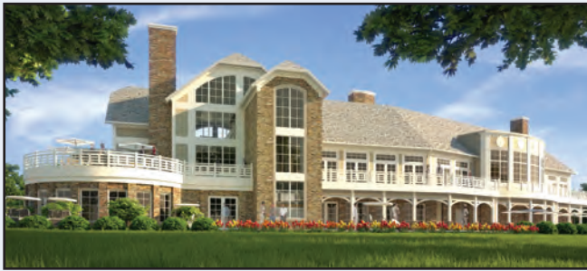
Pictured above are two architect's renderings of the front (top graphic) & rear (bottom graphic) of a proposed new clubhouse/banquet facility. Renderings by Steed Hammond Paul. (Click on BlueAsh.com for many more renderings showing inside portions of the facility.)