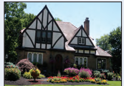
Pictured is the Committee's Choice Beautification Week Selection @ 10116 Kenwood Road